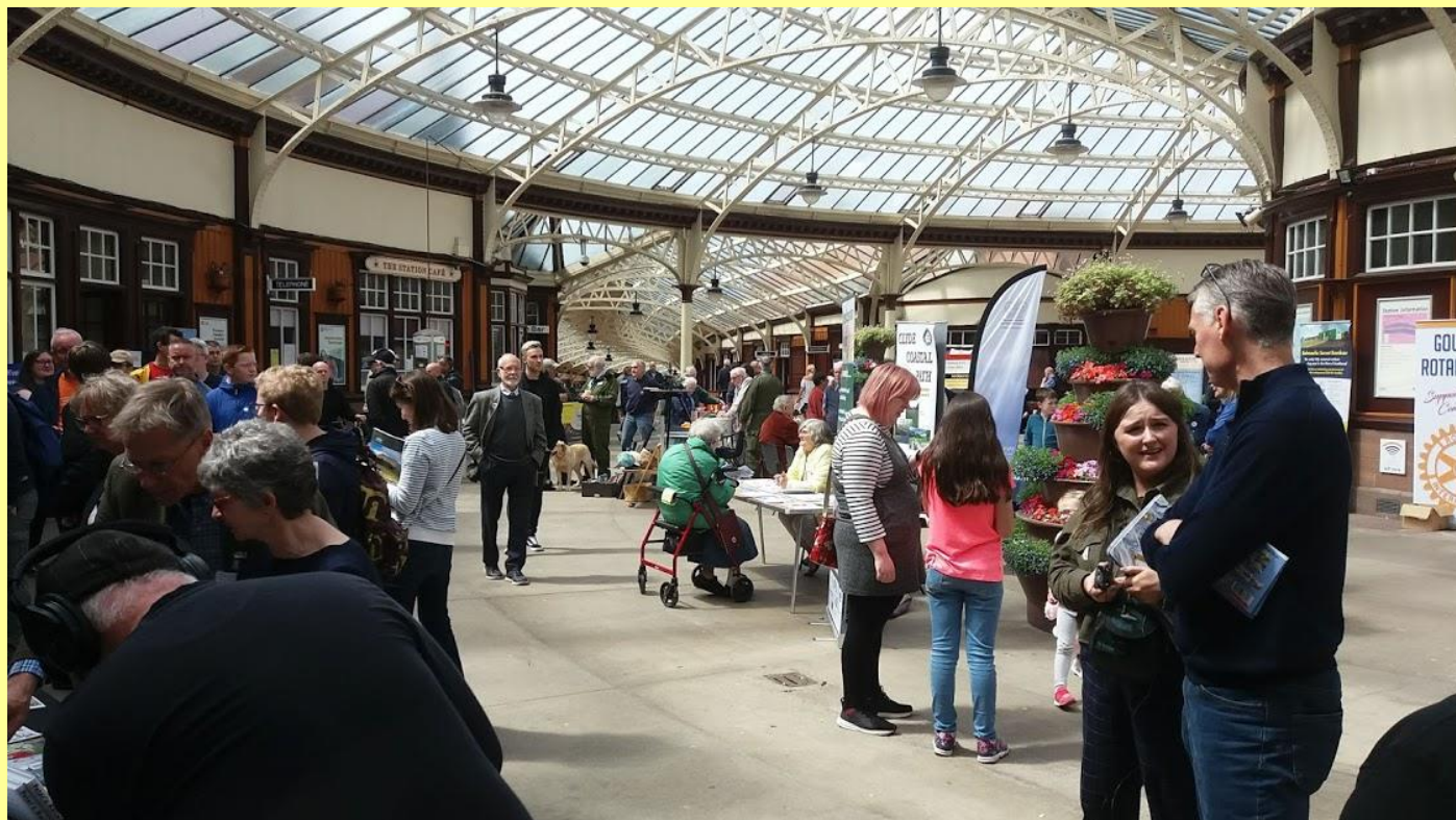
A busy scene on the station concourse.

When the Friends were founded in 2009, an Open Day was held at the station to attract support. So how better to mark our tenth anniversary than to hold another Open Day? The event went ahead on Saturday 22 June and was a great success, to judge by all the appreciative messages we received.